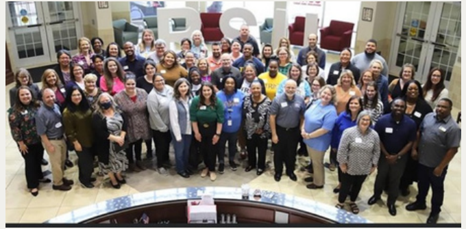
UB Staff enjoyed the 2023 ODSA Fall Summit on the Rogers State University campus in Claremore in October.