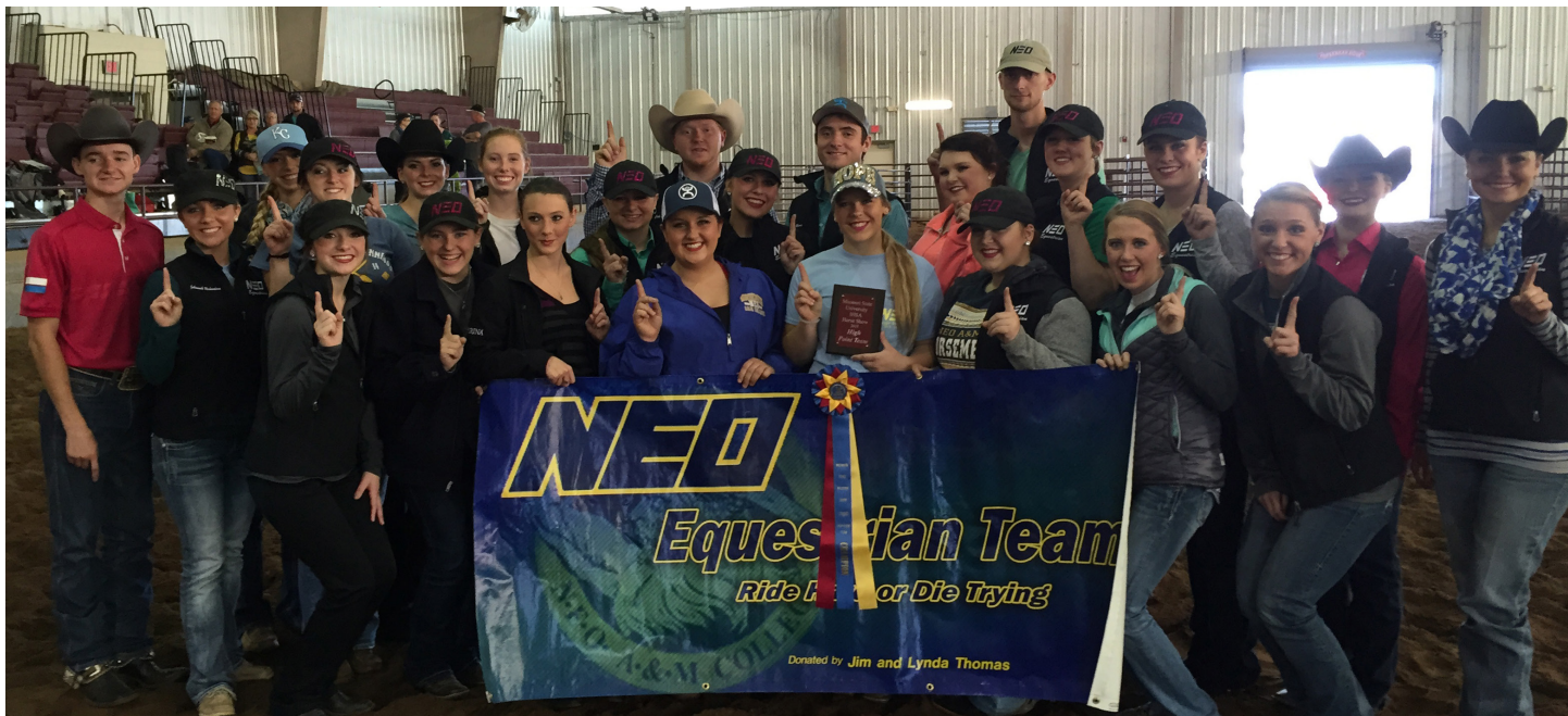
(The equestrian team traveled to MSU and earned the high point finish.)