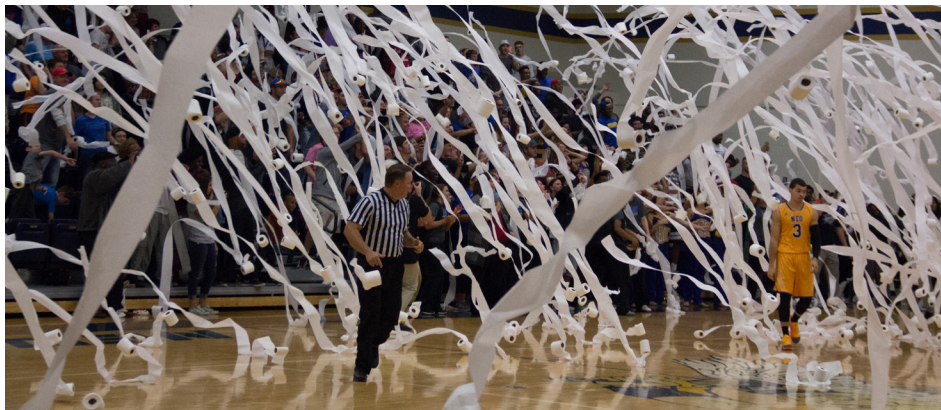
(The crowd throws toilet paper rolls onto the court after NEO scores the first basket of the season)

“This is our third year to do it and it has become one of our most popular games. We received a technical foul for the disturbance, but it is a foul that I am willing to give up to keep our fans, players, and students engaged.”