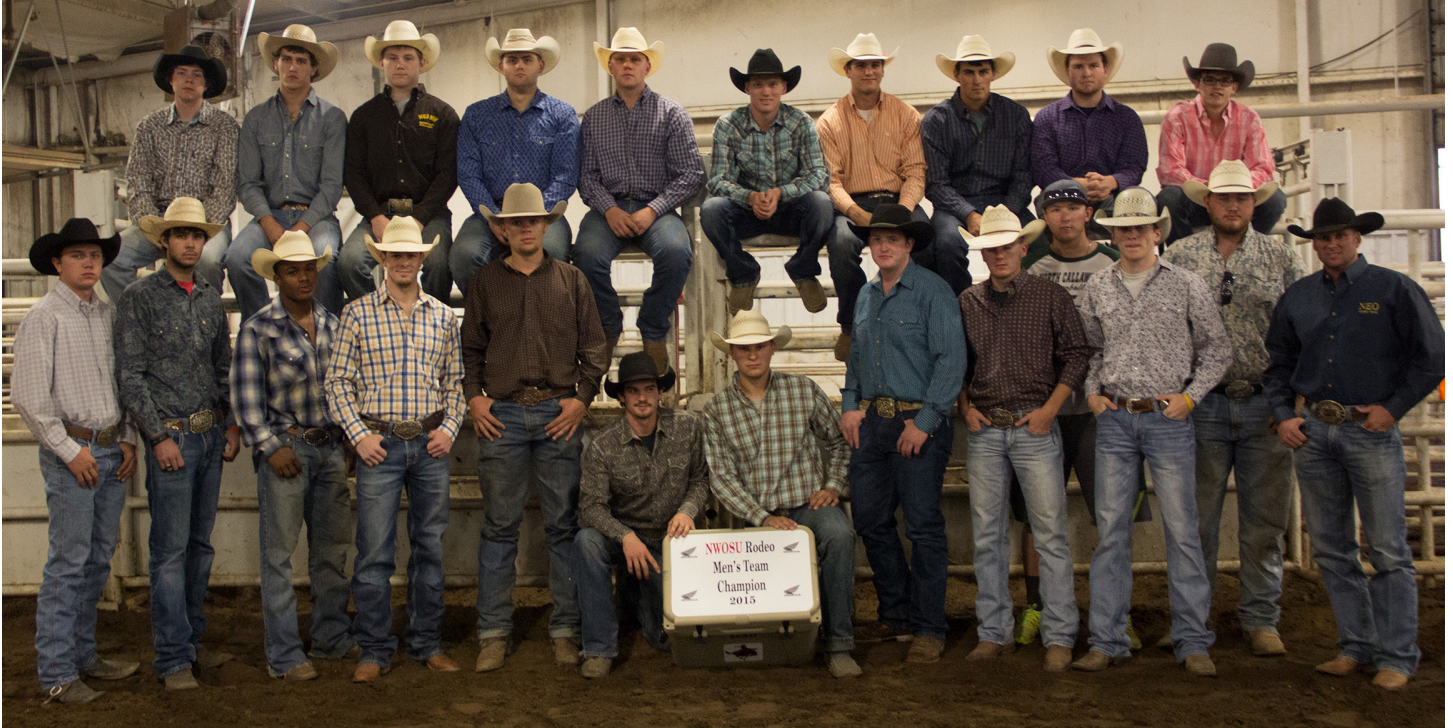
(The men's rodeo team proudly displays their prize from the Northwestern Oklahoma State University rodeo, a genuine Yeti cooler)