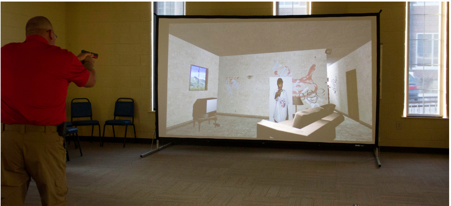
(NEO public safety officers receive instruction on using the MILO training system.)