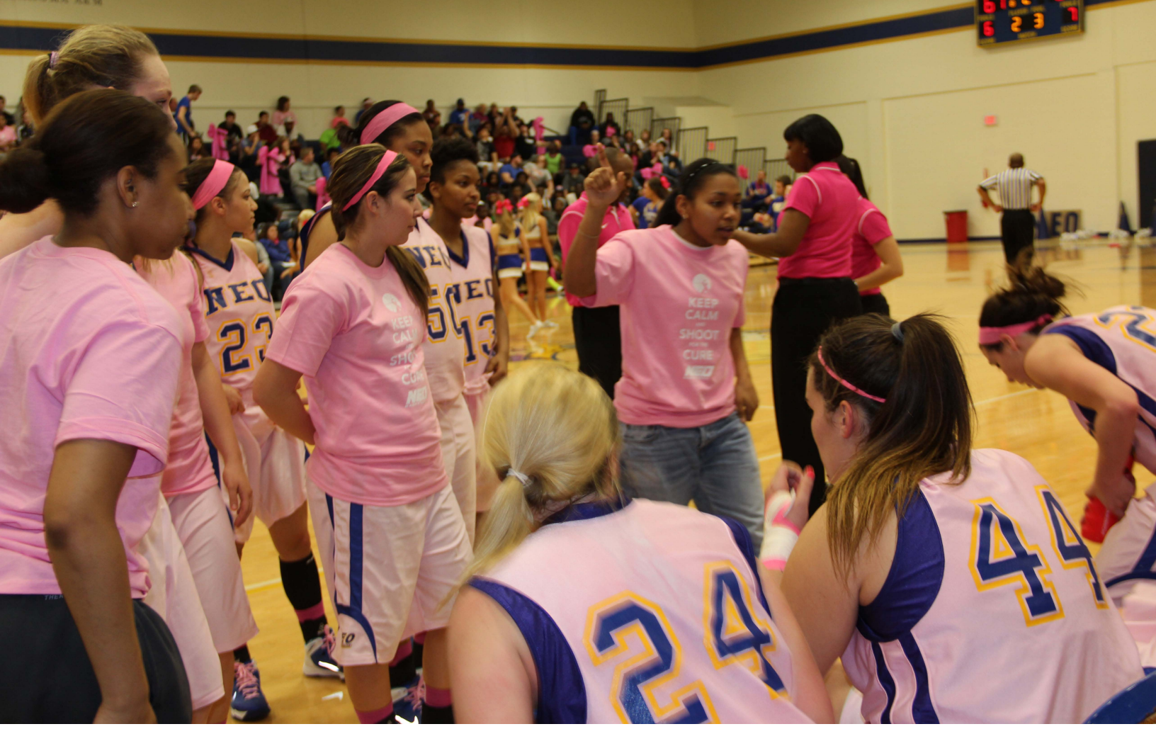
Last year's "Shoot for the Cure" game