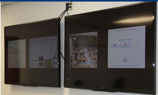
NEO's new polycom system is used for distance learning.