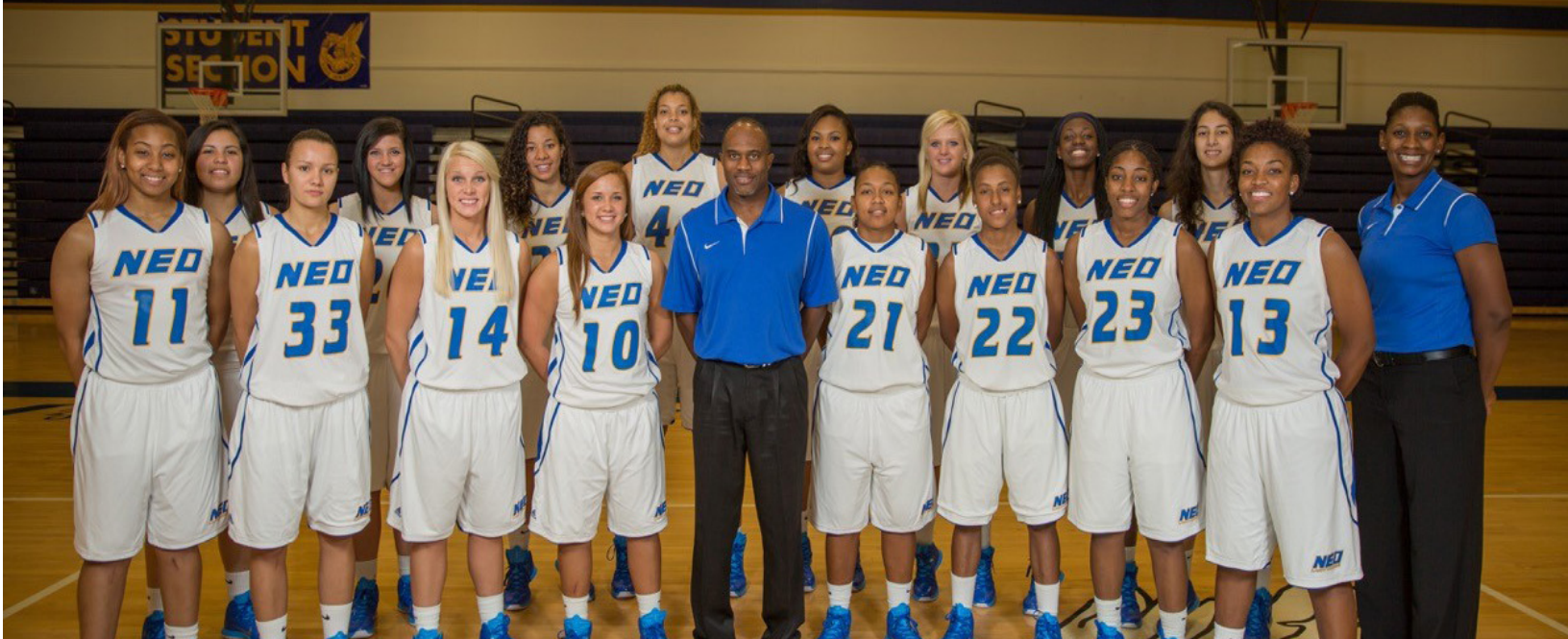
2014-2015 Lady Norse Basketball Team