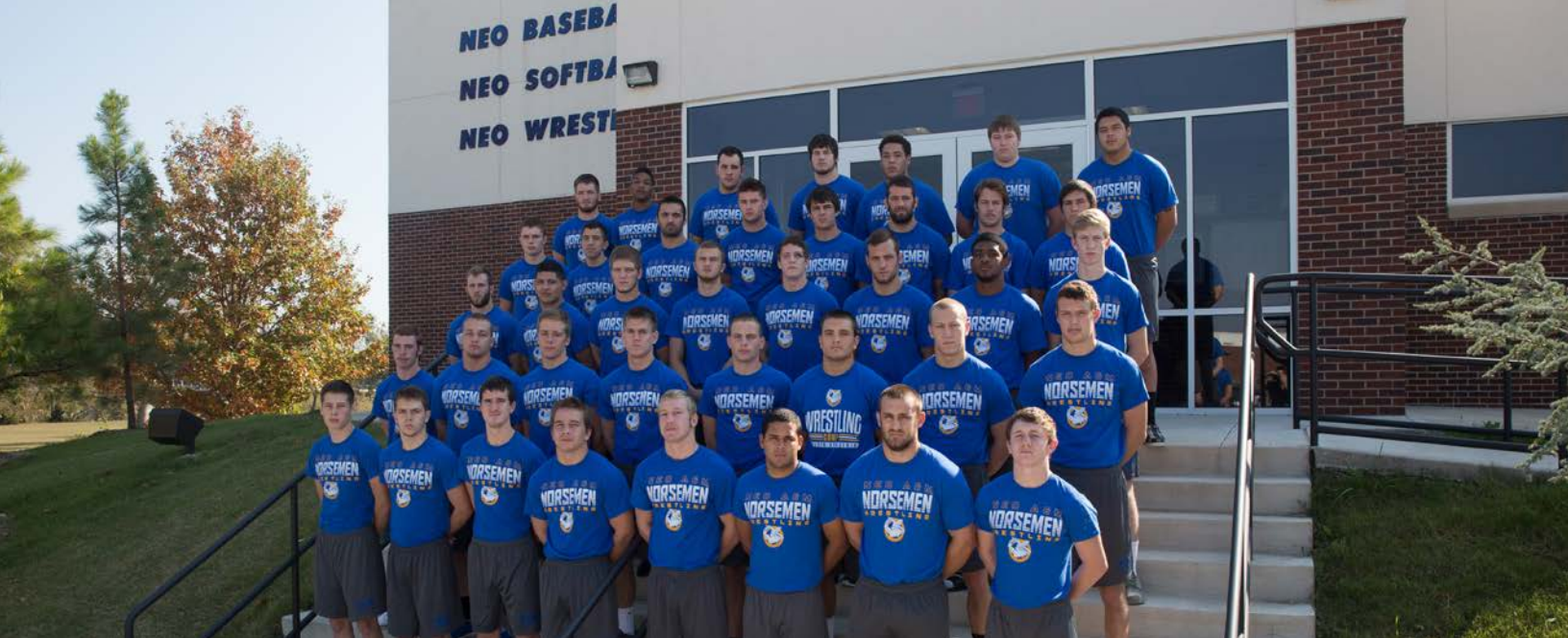
2014-2015 Wrestling Team