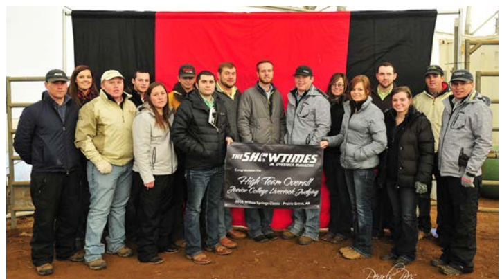
Willow Springs Classic 2015

More than 15,000 head of horses, cattle, sheep, swine, goats, llamas, alpacas, bison, yak, poultry and rabbits step foot on the grounds of the National Western Stock Show each year. The National Western Stock Show is noted for hosting the world’s only carload and pen cattle show, held in the historic Denver Union Stockyards.