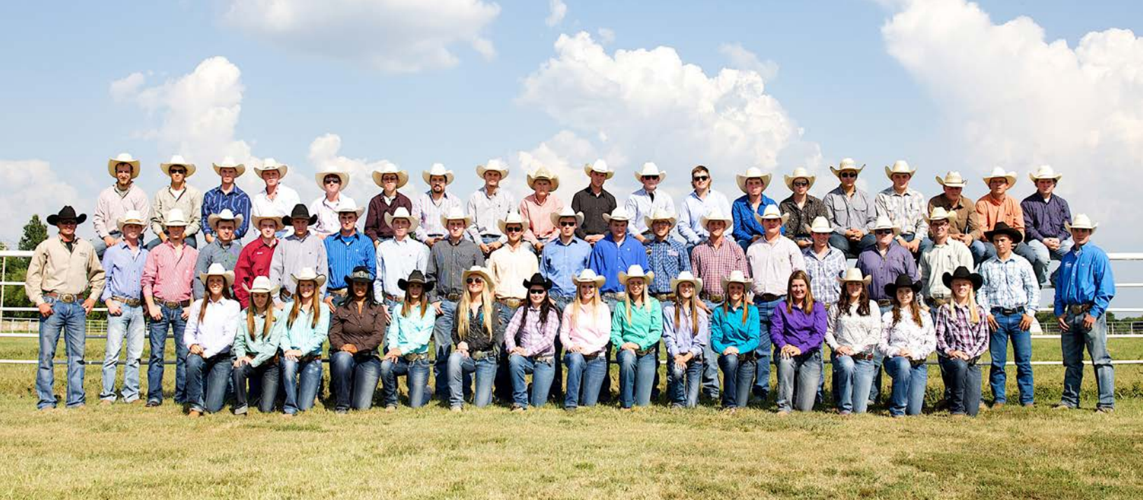
2014-2015 Rodeo Team