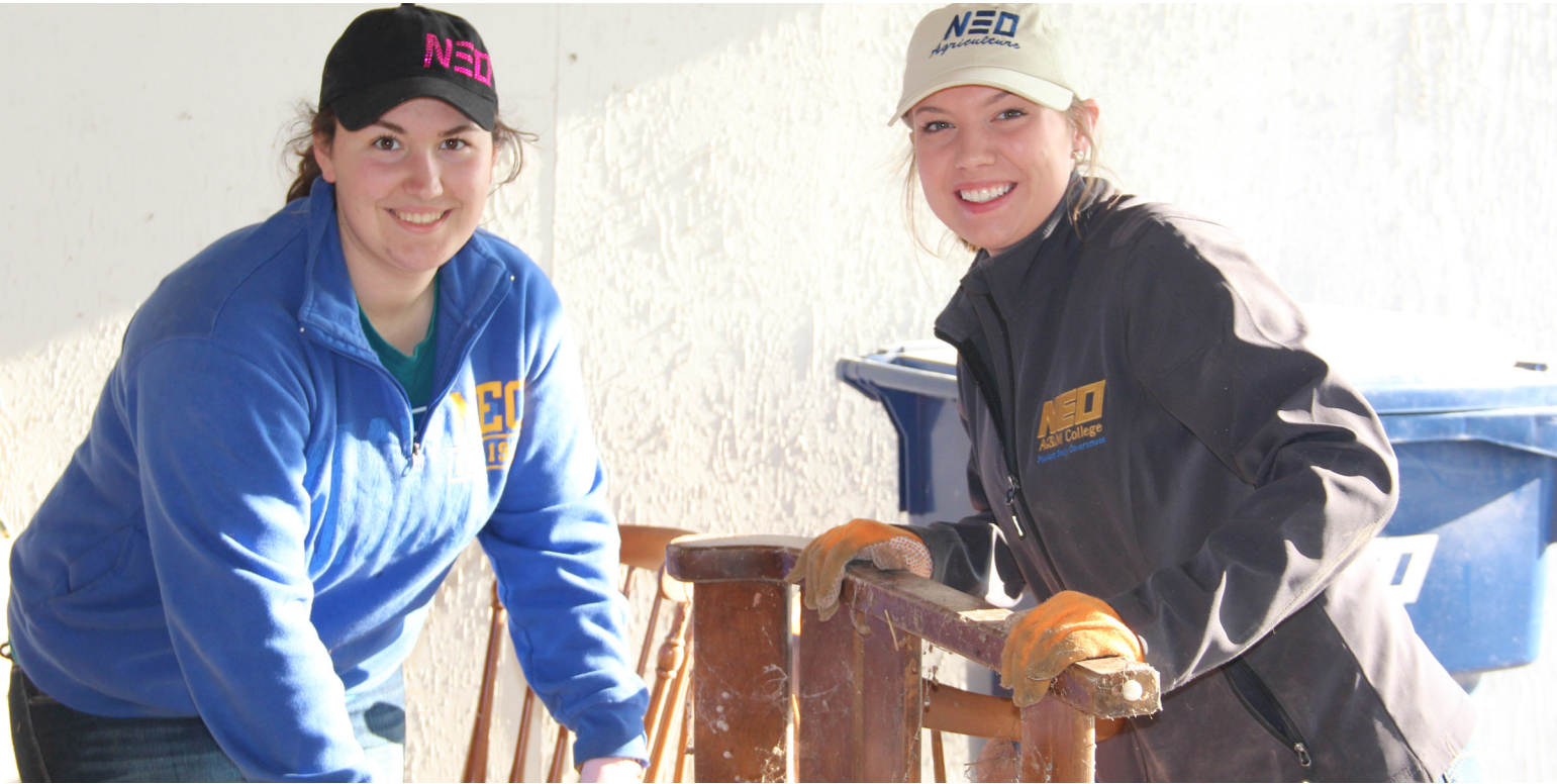
NEO students cleaning out a garage during the 2015 'Big Event' where students volunteer their time to the community as a way of saying