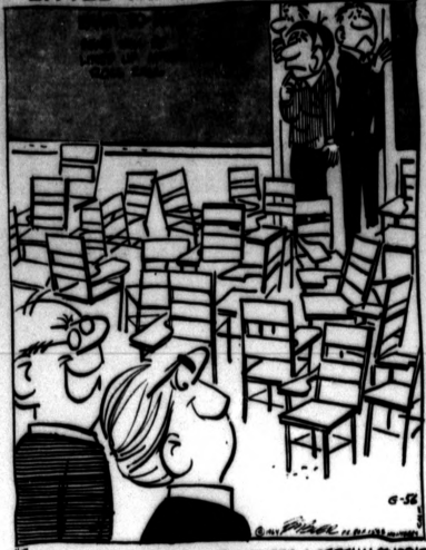
"I DO THIS ON EXAM DAYS - IT CONFUSES A CERTAIN GLUBBENT ELEMENT THAT LIKES TO GROUP AT THE BACK OF THE ROOM."