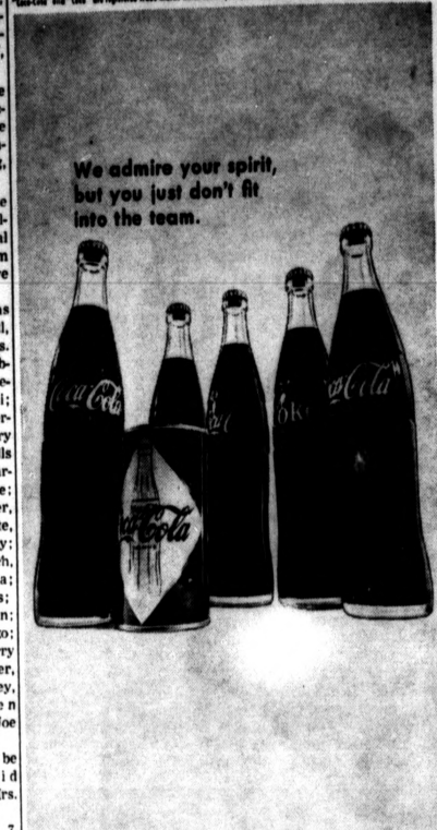
"Coca-Cola" and "Coke" are registered trade-marks which identify only the product of The Coca-Cola Company

Coca-Cola is on everyone's team. That's because Coca-Cola has the taste you never get tired of... always refreshing. That's why things go better with Coke... after Coke... after Coke.