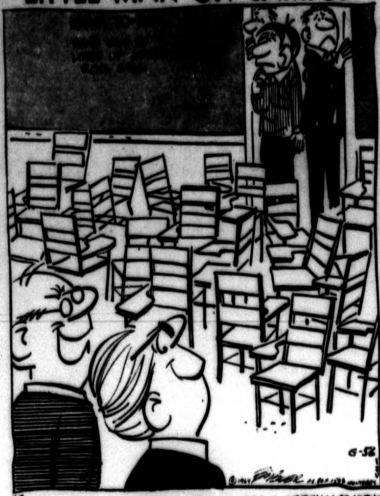
"I DO THIS ON EXAM DAYS — IT CONFUSES A CERTAIN STUDENT ELEMENT THAT LIKES TO GROUP AT THE BACK OF THE ROOM."