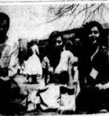
PHI THETA KAPPA TO Elect New Officers

Over 1,300 seniors from 36 surrounding schools participated in one of the most successful Senior Days of all time. On Friday, April 20, seniors from Northwestern Oklahoma, Missouri, and Kansas arrived on the campus, and were met by student hosts who took them on the various tours. These hours consisted of the Winart Pool, the Blue Star Boat Manufacturing Co., the B. F. Goodrich Co., and they also covered the entire campus in picnic style, while they were eating they were entertained by the Norse Stars and the college band.