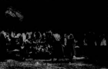
LUNCHTIME SENIOR DAY—This was the scene Senior Day as the visiting seniors were served their lunch on the campus.