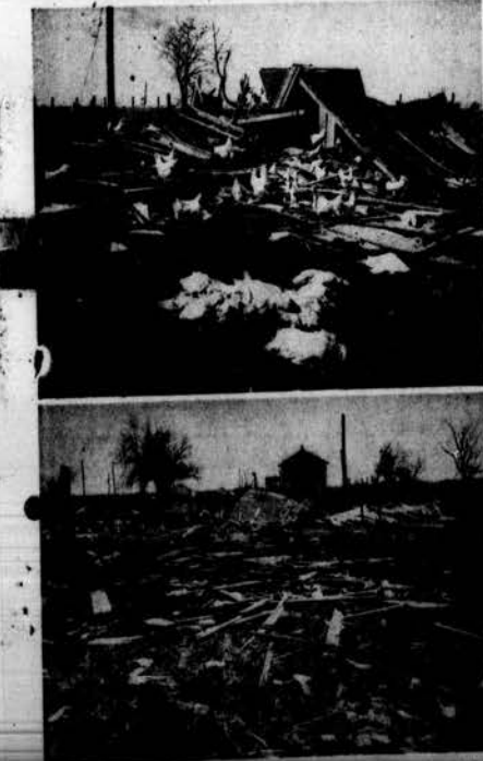
THE TWO ABOVE PICTURES show what force last week's tornado left at the college farm. In the top picture the chicken house of the college farm is a total loss as is the barn in the bottom shot. The abandoned house in the farm was not so bad.