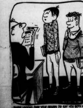
"NEVER LEARNING FROM YOUR OWNERS TO SAY YOU BOTH HAD TO BE PROUD WORKING AGAINST YOU - THE FACULTY"