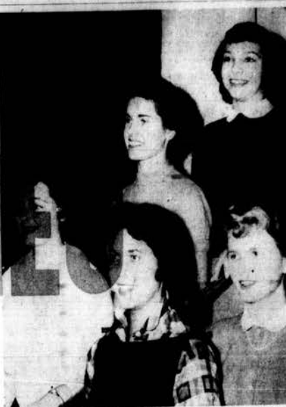
PROSPECTIVE ROYALTY—Pictured here are this year's choice of campus beauties—and brains. Five organizations are vying to elect their choice by raising funds selling football tickets and making in business.

Norse Wind Displays New Head and Body Dress in This Edition About Face! Yes, the Norse Wind also has a new dress for this Homecoming edition. ("It's style about permits capital 'H' for Homecoming.")